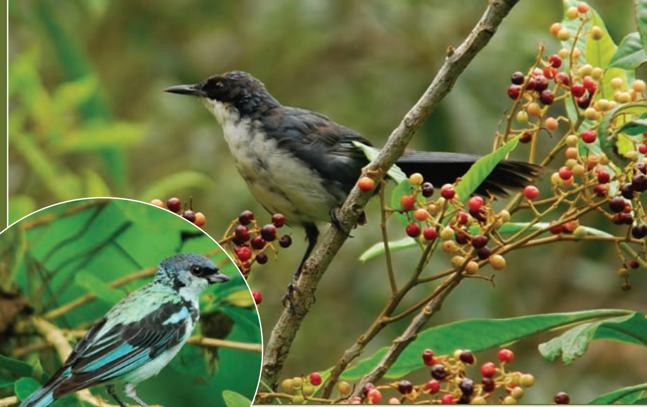
Above: Blue-and-white Mockingbird Melanotis hypoleucus is common in secondary scrub and open pine-oak forests and has been recorded in seven Guatemalan IBAs; this is an immature